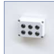
6 pin patch