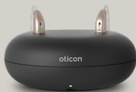
Oticon Desk charger